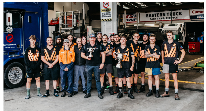
Our workshop team, proudly taking home Service Dealer of the Year 2024

And, of course, a shout out to our incredible inspections team and our superhero admin staff for their significant contribution to our win of Dealer of the Year for 2024