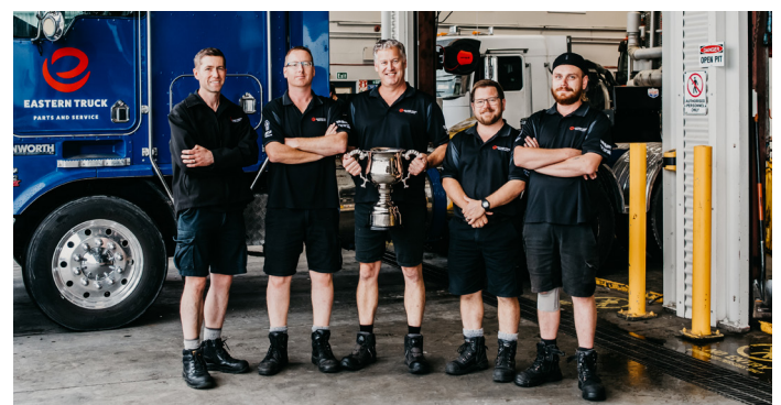
Our parts team, receiving the award for Parts Excellence